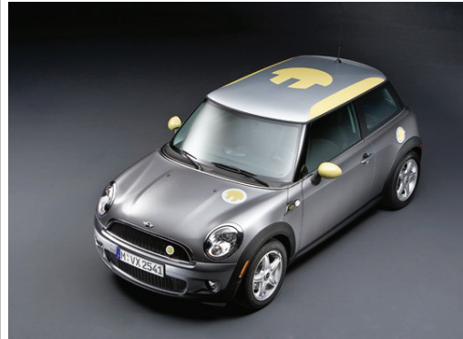
Rogers of Motorsport Memories

Nissan had a few electric cars to drive at the show and have a fleet of 10 0 operating in Tokyo. Smart have another 100 electric versions running around London. Size-wise MINI's are about 12 ft long, which is comparably large compared to The Electric Smart Car, which I was also able to test drive. The Electric Smart Four-Two is only 8 ½ ft long; but since it's a French car, I won't write anything more about it! Story and photos by Bill