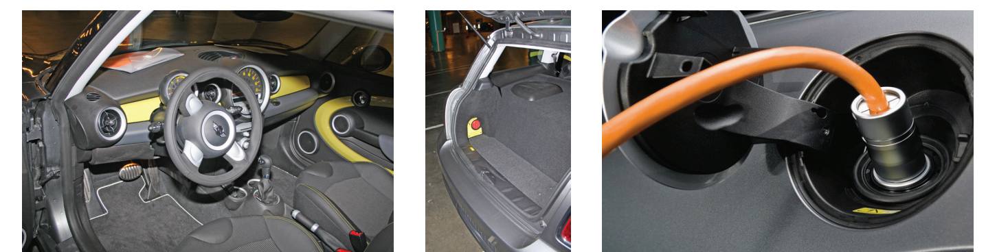
Some of the specialized equipment used by the MINI E, a gauge shows how much electricity you still have. The special Charging unit. Steering wheel & dash looks like the gas model. Smallish boot due to the batteries. Plug power into here.