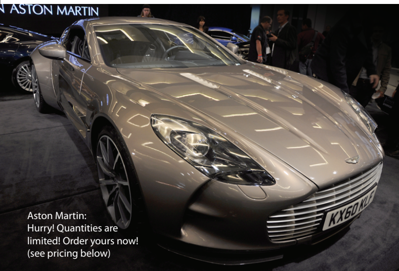
Aston Martin: Hurry! Quantities are limited! Order yours now! (see pricing below)

The One-77 is exclusive – with production limited to 77 cars; hence the One-77 moniker. It features a full carbonfibre monocoque with aluminum body panels and front mid-mounted 7.3-litre normally aspirated V12 engine, putting power to the rear wheels through a rear mid-mounted 6-speed automated manual gearbox.