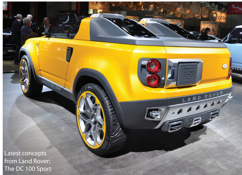
Latest concepts from Land Rover: The DC 100 Sport