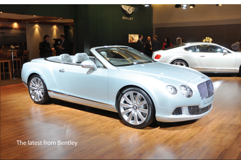
The latest from Bentley