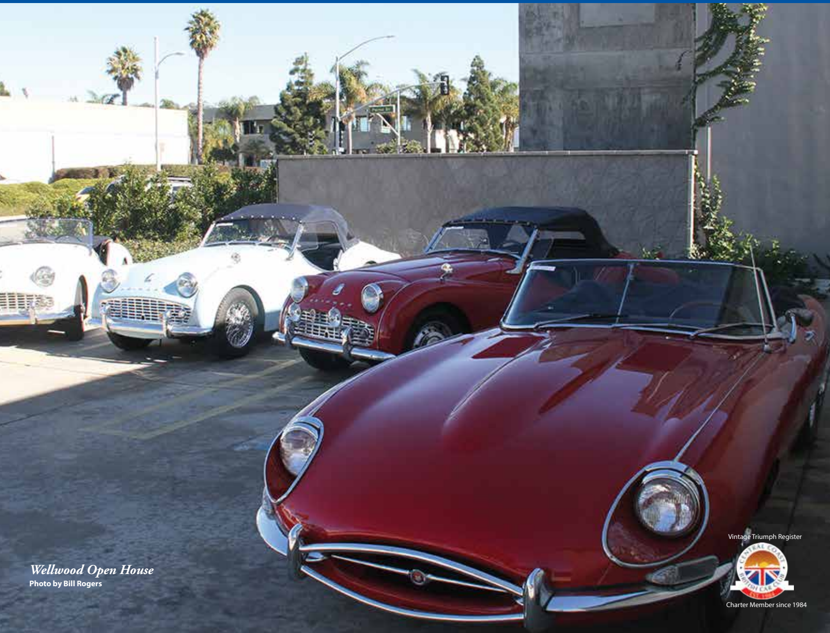
Wellwood Open House