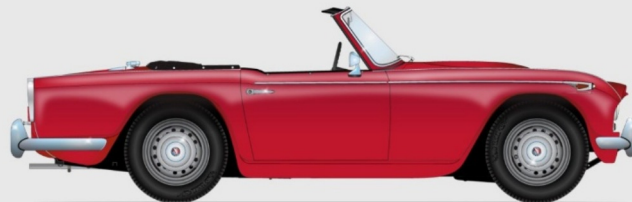
60 years of the TR4A