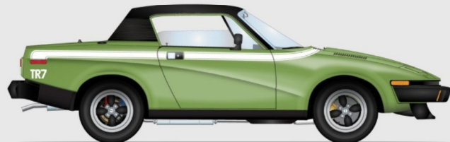
50 years of the TR7