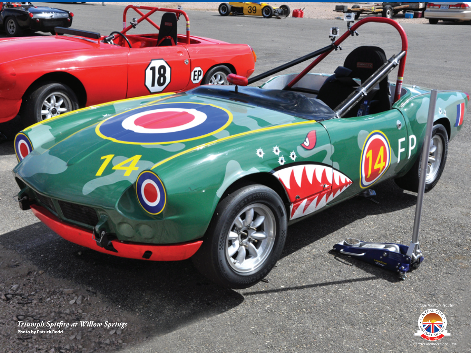
Triumph Spitfire at Willow Springs