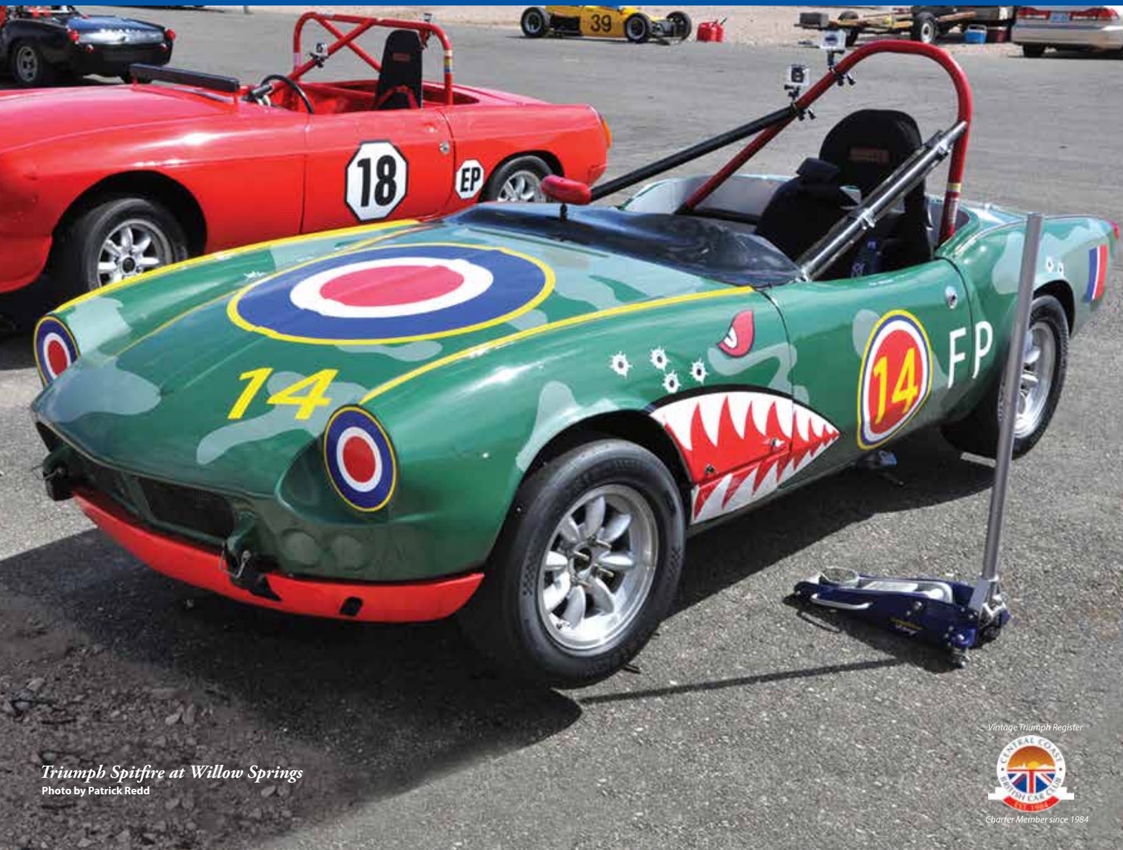
Triumph Spitfire at Willow Springs