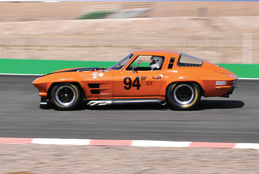
in addition to the classes featuring British, German, Italian, etc. sports cars, there are also several other interesting races that take place throughout the day.