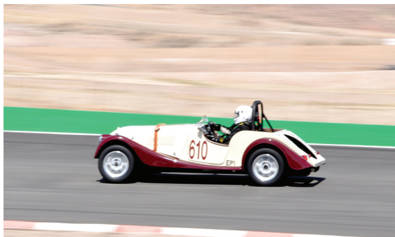
I later read on one of the forums that this Morgan and the green Curtis (below image) got tangled up with a Triumph on Sunday's race.