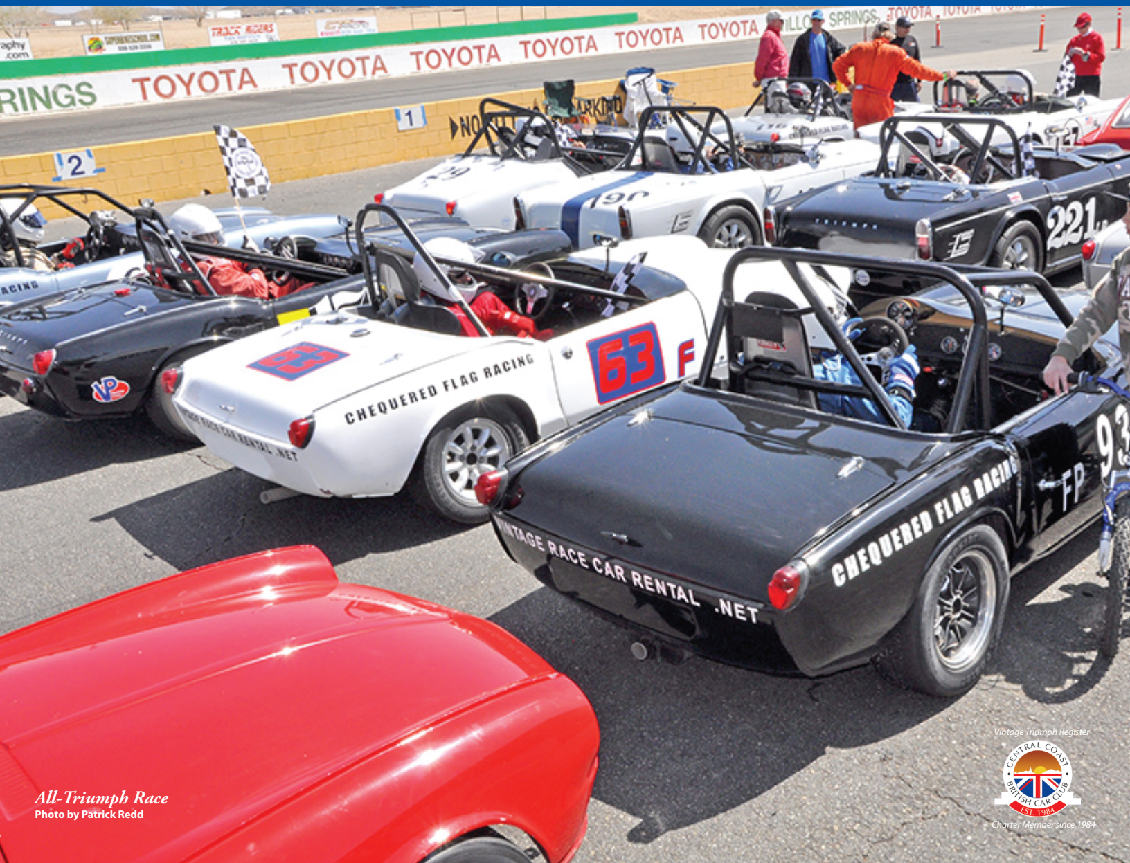
All-Triumph Race