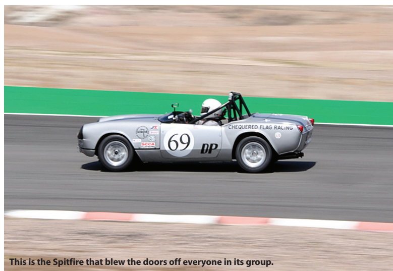
This is the Spitfire that blew the doors off everyone in its group.

This was my first visit to Willow Springs. I made it just in time to see the feature race, a race grid filled with only Triumphs - Spitfires, TR3's, TR4's, and even 1 GT6. It was a pretty close race with the exception of one Spitfire that blew everyone's doors off. Some of these cars later participated in another race so I imagine some of the drivers were taking it easy.