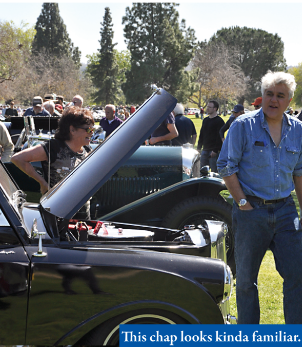
This chap looks kinda familiar.