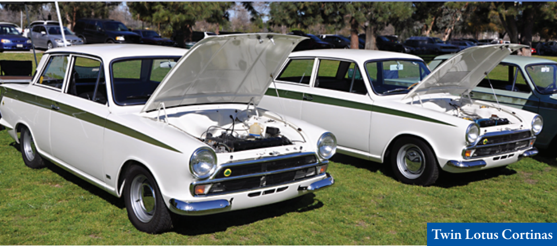
Twin Lotus Cortinas