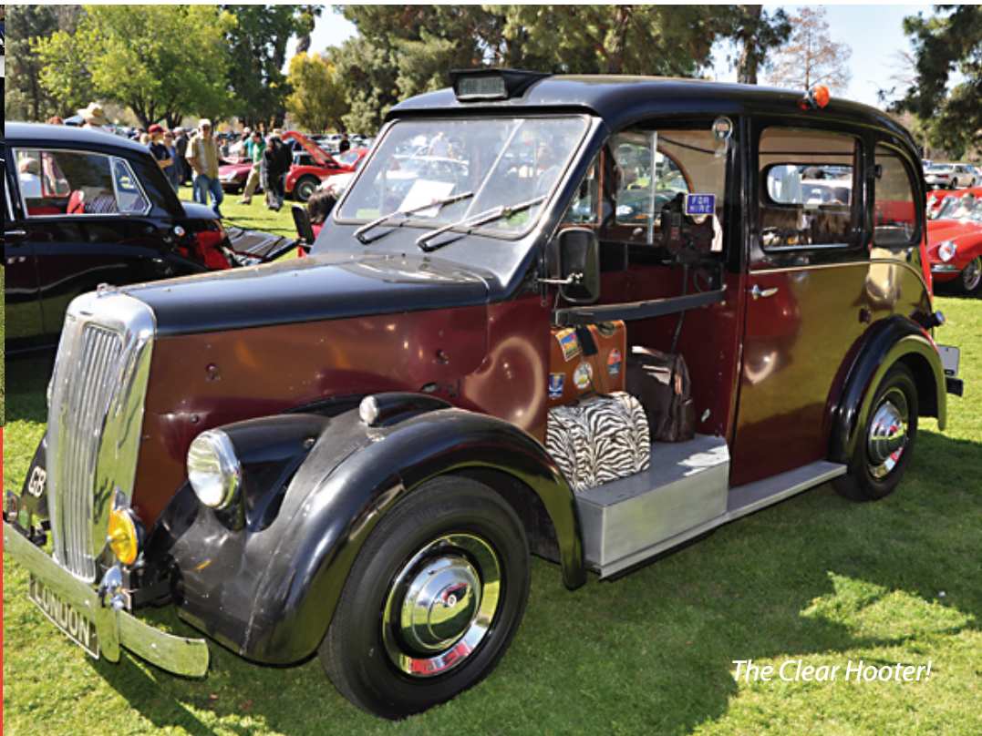
The Clear Hooter!