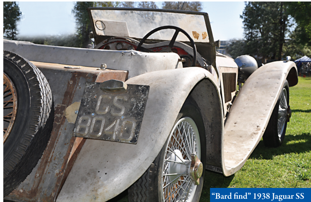
"Bard find" 1938 Jaguar SS