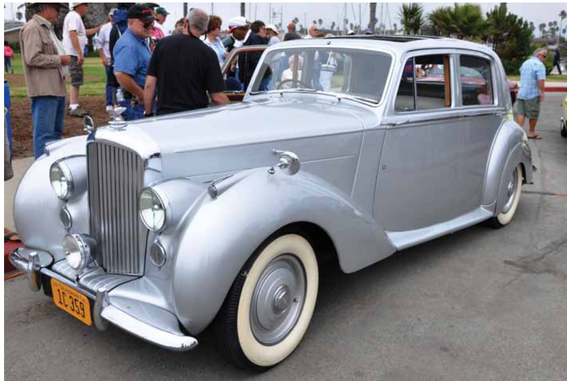
Winner of the "Most Elegant" award.