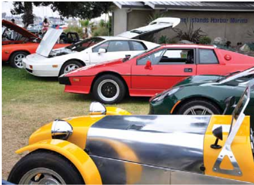
Lotus was well represented with a good mix of models