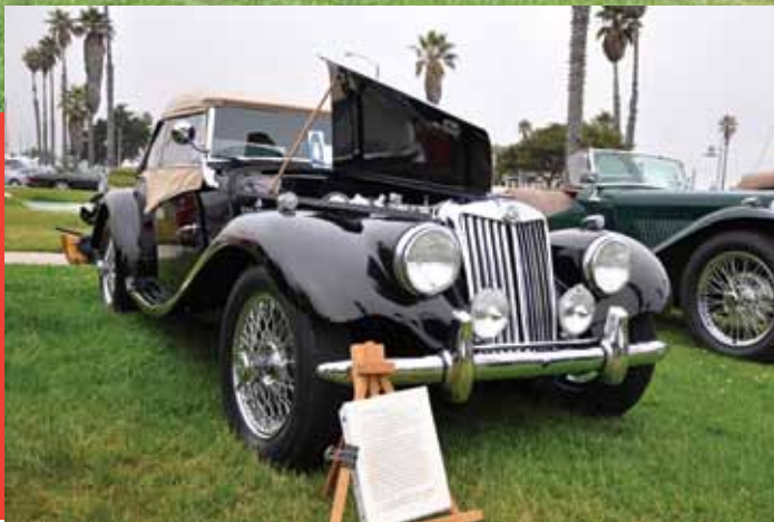
1953 Nash Healey - Winner of the Tartan Surfboard Award. It also received the "President's Choice" award.