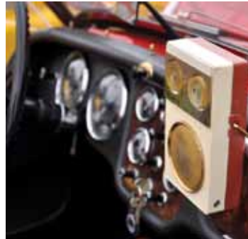
Some ICE (In-Car Entertainment) in a TR2