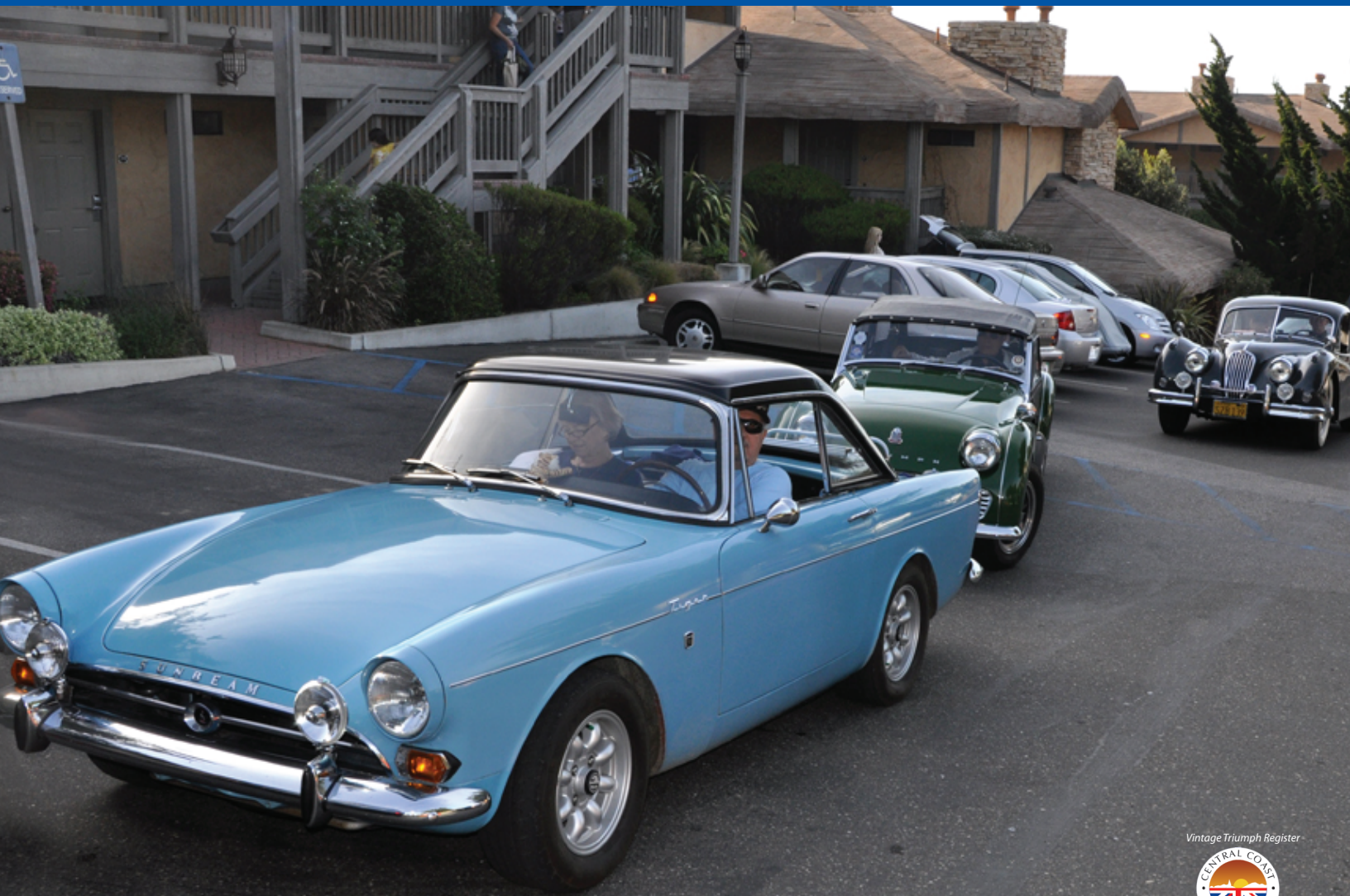
Heading out for wine country, Pismo Beach