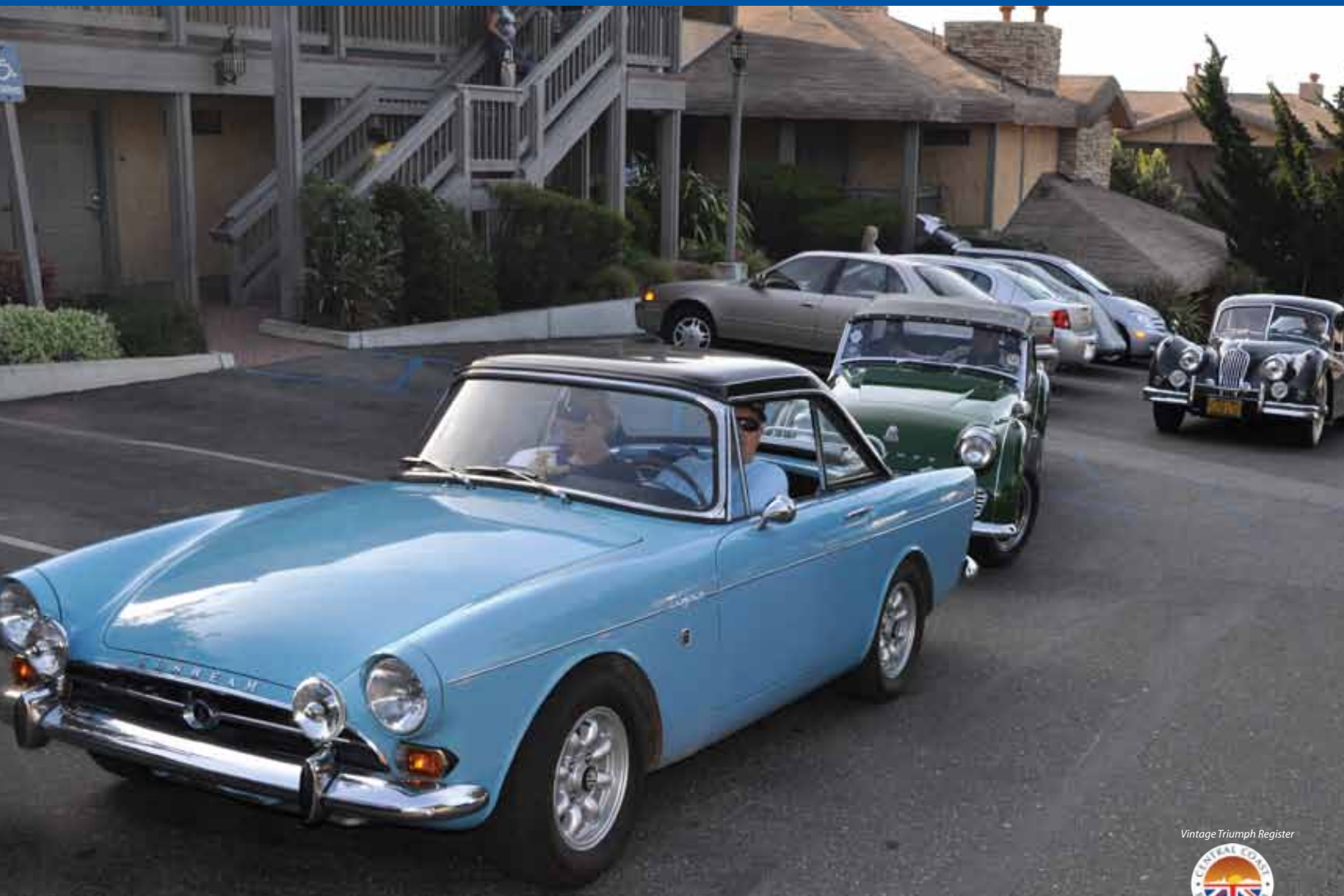
Heading out for wine country, Pismo Beach