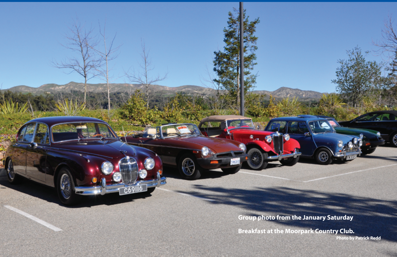
Group photo from the January Saturday