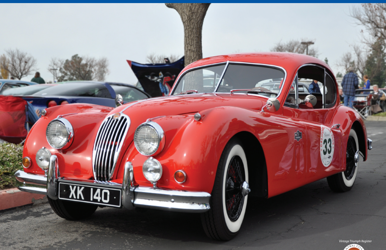
Jaguar XK140 at Motor For Toys