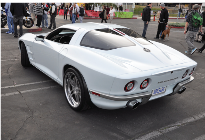
Rossi SixtySix Corvette