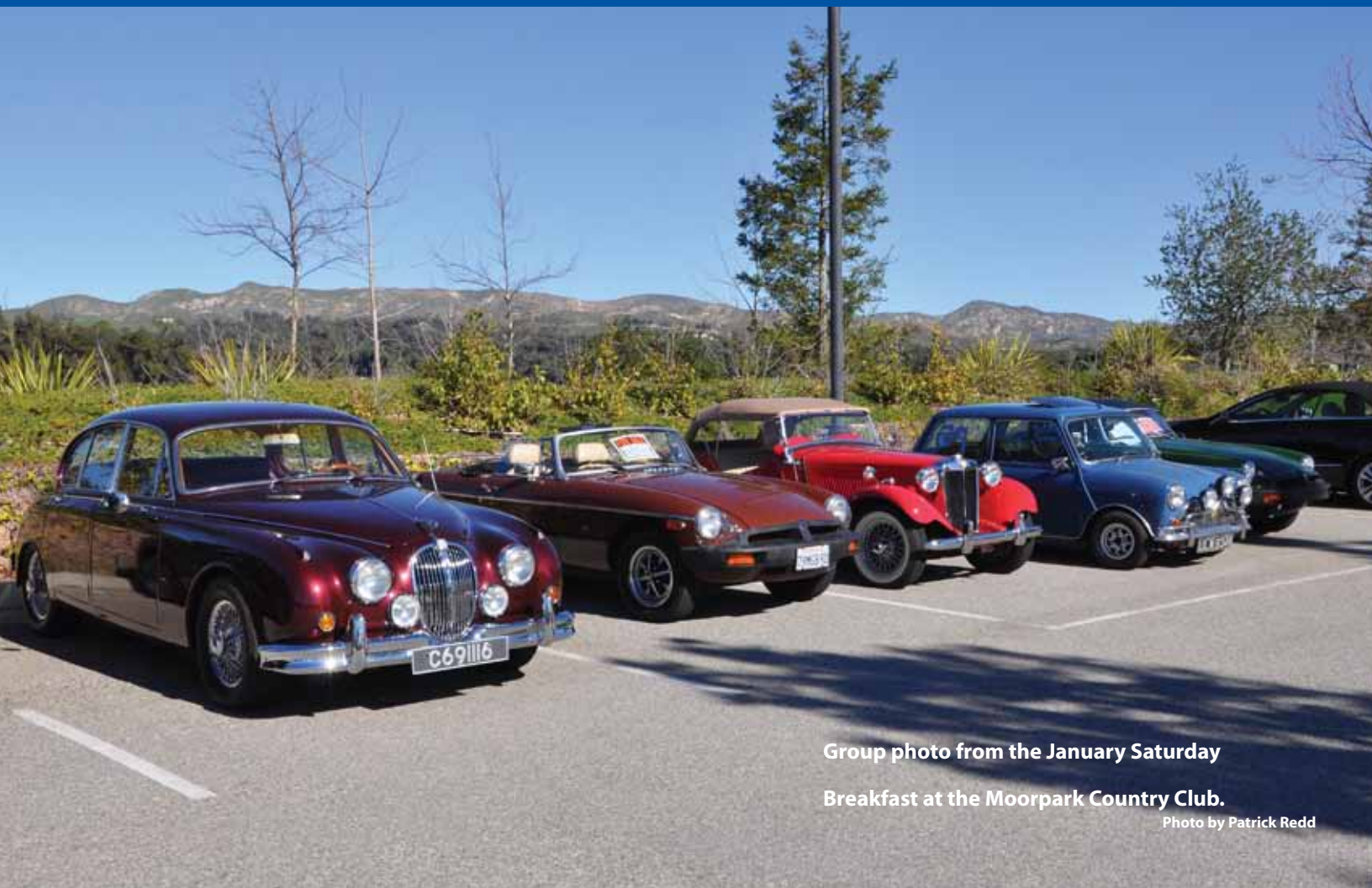
Group photo from the January Saturday