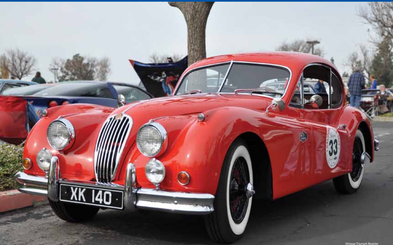
Jaguar XK140 at Motor For Toys