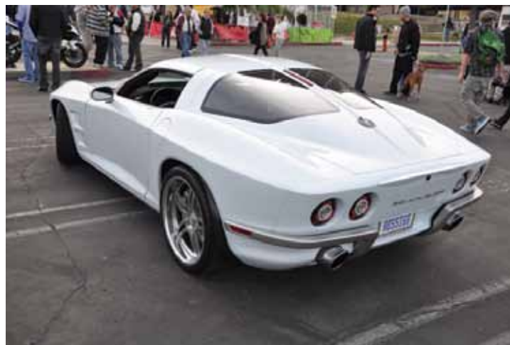
Rossi SixtySix Corvette