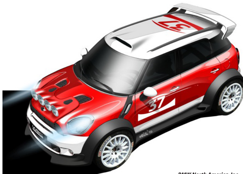
BMW North America, Inc.

Prodrive Chairman David Richards, who won the 1981 World Rally Championship as co-driver to Ari Vatanen, said, "We already have a significant number of confirmed customer orders for the new Mini rally car, with the first deliveries