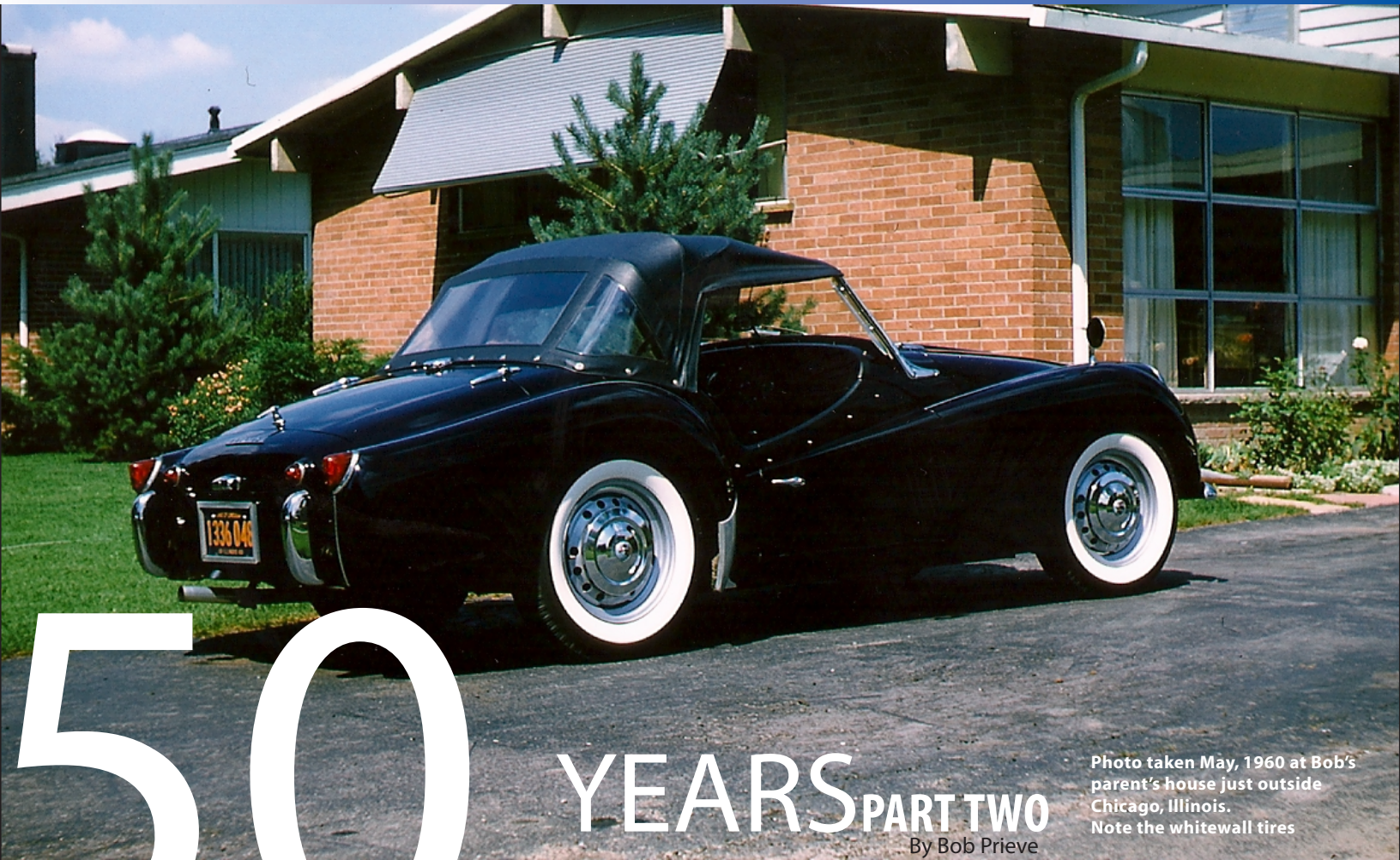
Photo taken May, 1960 at Bob's parent's house just outside Chicago, Illinois. Note the whitewall tires