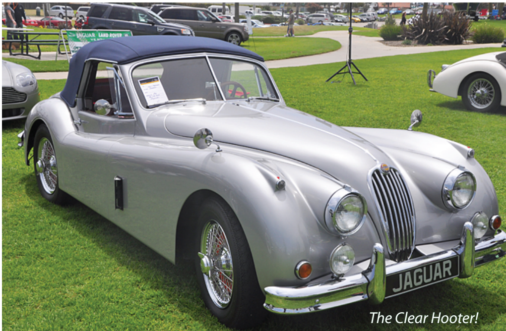
The Clear Hooter!