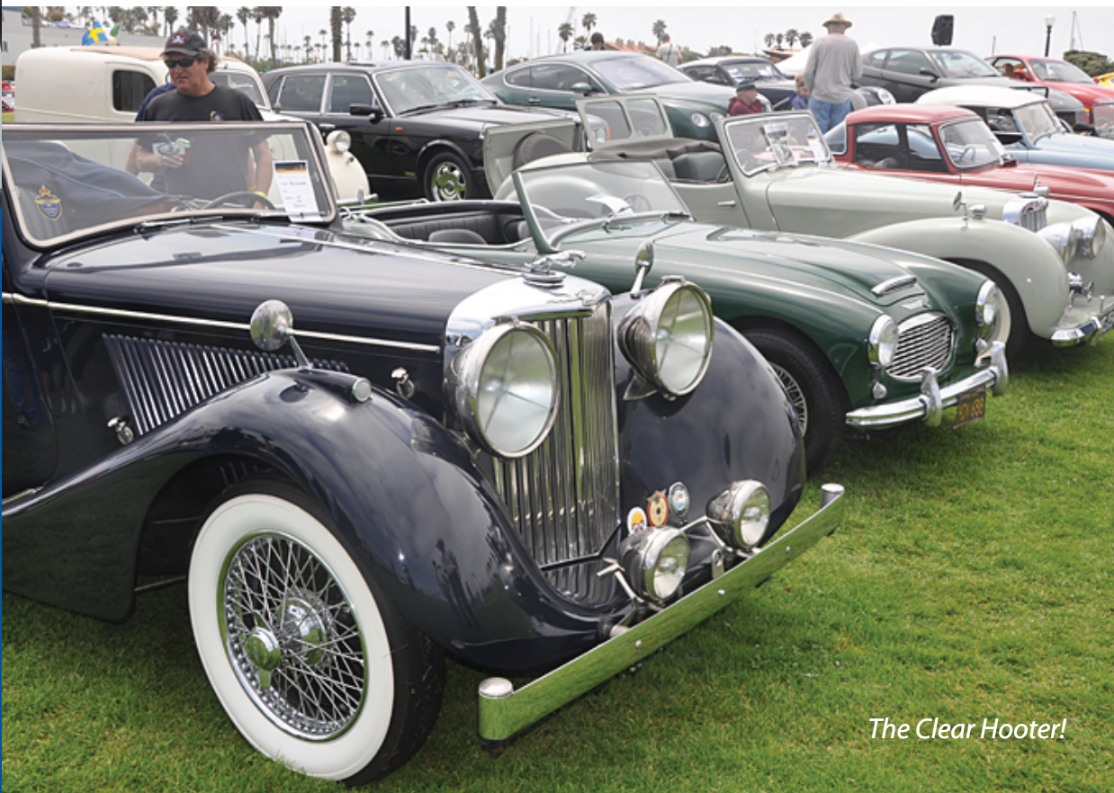
The Clear Hooter!