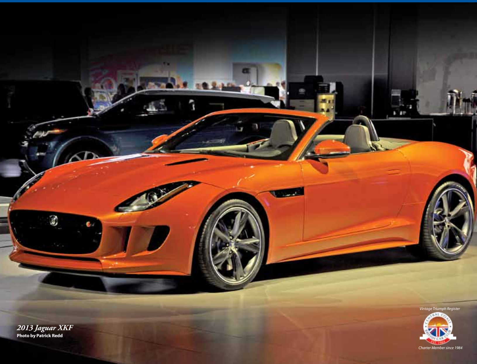
2013 Jaguar XKF