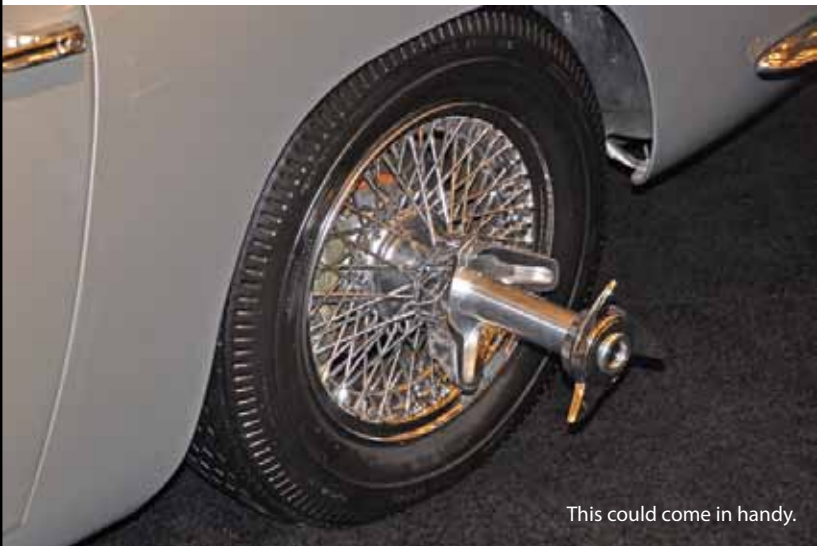
This could come in handy.

Along with several tweaks to the suspension, the car doesn't come with a backseat or a radio. 2000 cars are being built and just 500 are to make their way to the US.