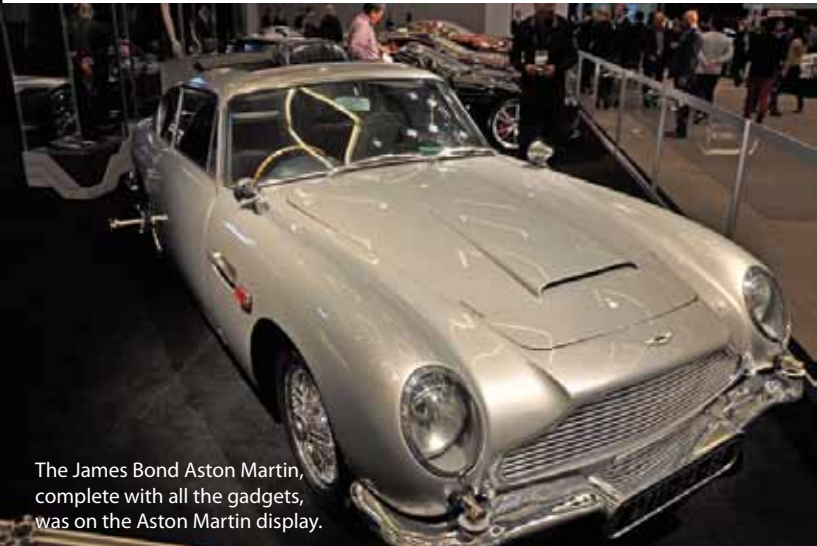
The James Bond Aston Martin, complete with all the gadgets, was on the Aston Martin display.