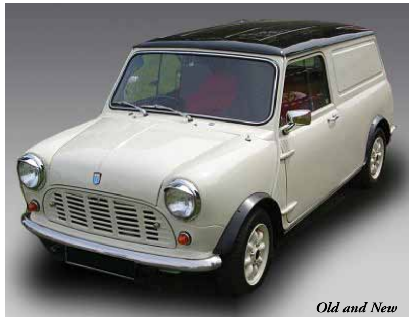
Old and New

Will MINI go a step further and come out with a new MINI pick-up? Stay tuned.