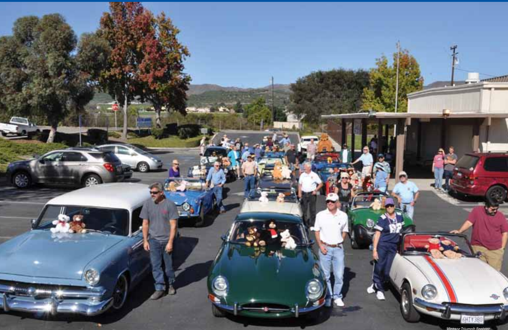
The Teddy Bear Run