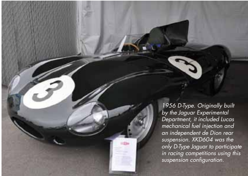
1956 D-Type. Originally built by the Jaguar Experimental Department, it included Lucas mechanical fuel injection and an independent de Dion rear suspension. XKD604 was the only D-Type Jaguar to participate in racing competitions using this suspension configuration.

Also displayed were the Cunningham racers and the more modern XJR race cars. The display took one through a timeline of Jaguar's racing history. It was interesting to note the evolution of the cars as one walked down the line. Outside of the main area were several C and D Types on display, all with impressive stories or race histories behind them. As part of these celebrations, the legendary American Jaguar privateer Bob Tullius was also honored.