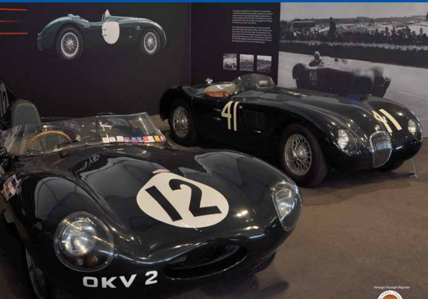
Le Mans Jaguars at the Monterey Motorsports Reunion