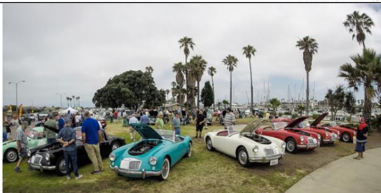
CCBCC Car show Photo

HERITAGE BANK OF COMMERCE The Fine Art of Banking