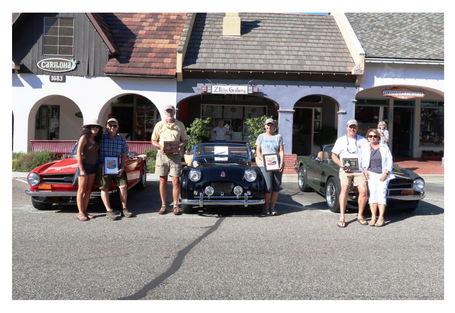
Winners at the Wheel and Windmills Car Show See article and more pictures on page 6-7