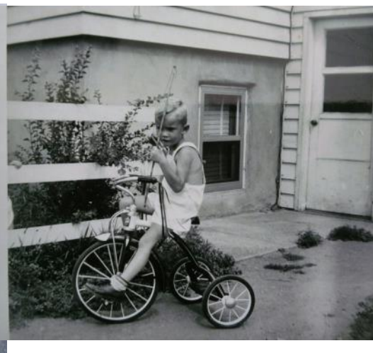
Guess who the Oct. kids are? They are married and met many years after these were taken!