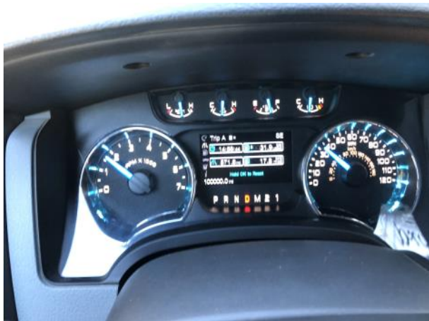
Sag wagon turning over 100,000 miles !!!