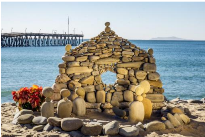
This stone Nativity was built by a local artist on the California Street beach (notice the stone people).