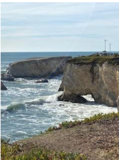
Picnic Lunch at Dinosaur Caves Park

To make reservations at the Apple Farm Inn, just call 805-544-2040 and select #1 for the front desk. Tell them you are with the Central Coast British Car Club and are making reservations for the Main Inn on the night of May 6 th . The room rate should be $105 plus tax which is a 25% discount.