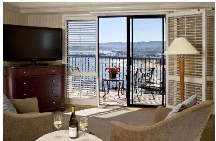
Typical room view at Monterey Bay Inn on Cannery Row