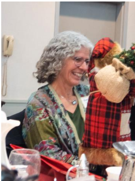
67 club members attended and enjoyed Salmon, Tri Tip and Chicken Pasta. Lots of fun with a great raffle, white elephant gifts, accolades, and great folks.